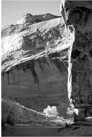
The sheer sandstone walls of Horseshoe Canyon